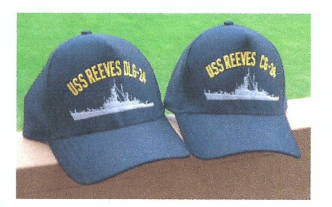
DLG or CG Ballcaps - $12.00 each + s/h