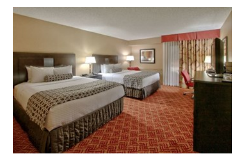
Double Queen Standard Room

Price wise, the Hotel Elegante came in at $120.00 per night, which is only one dollar more per night than San Diego. The deal features free airport transportation from the Colorado Springs Airport (COS), which we did not have in San Diego. Remember, that airport rides were going to cost us $12.00 per person, each way. All the other perks we like in our reunion routine are there; like free breakfast every day, free wi-fi, free local transportation, and a 20% hotel food discount are all in place. The hotel features a restaurant and bar, a coffee and sweet shop, indoor and outdoor pools, an indoor children's playground, a dog run, and plenty of free parking.