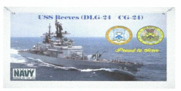
USS Reeves HD Vinyl Banner $30.00 each + $14.00 s/h Great looking 30" X 48" banner with grommets

To order items, please fill in the information and mail to Kurt Stuvengen (address below). Check or Money order only.