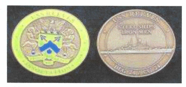
USS Reeves Challenge Coins - $14.00 each + $3.50 s/h Beautiful acrylic coated custom coins, 2" dia. (limit of 3)