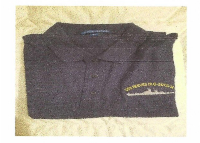
Embroidered Golf Shirts $20.00 each (2X & 3X add $2.00)