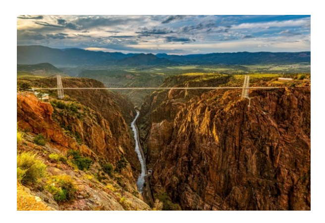
Royal Gorge Bridge and Park

Take your Colorado adventure to the highest and most famous suspension bridge in America, which standing 956 feet above the wild Arkansas River. This incredible engineering feat is a wonder to behold and a fitting addition to the amazing beauty of the Royal Gorge Region of Colorado. Constructed in 1929, the bridge was built for people to take in the timeless beauty of this geological phenomena and is not part of a road or state highway system. The bridge was designed to hold more than 2,000,000 pounds with 100 tons of steel supporting the deck. In 1982, the bridge was refurbished with installation of new anchor cables, replacement of bridge abutments, and the addition of a wind cable system designed to allow the bridge to withstand up to 125 mph winds. It's amazing to walk across the bridge and stare down at the Arkansas River and the railroad track which are 956' below. There are some zip line rides available across the gorge for those with plenty of nerve. More information can be found at <a href="https://royalgorgebridge.com/rides-attractions/royal-gorge-bridge/">https://royalgorgebridge.com/rides-attractions/royal-gorge-bridge/</a>