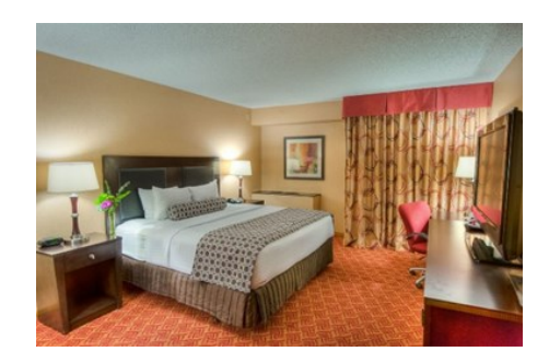
King Standard Room

Unfortunately, our normal reunion dates in the first week of October were not available, so we advanced the calendar by one week to the last weekend in September.