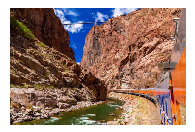
The Royal Gorge Route Railroad

The Royal Gorge Route Railroad is a tourism train line runs right through Colorado's grandest canyon, with unmatched Colorado scenery and the most amazing section of railroad track in the country. The train operates through the Arkansas River gorge in Canon City, passing under the Royal Gorge Bridge by a mere 956 feet. The railroad features stunning 1950s renovated engines and rail cars, vista-observation cars, and open cab observation cars. All with first-class food, and exceptional service. The rides start at their beautifully restored train station in Canon City, then travels 12 miles along the Arkansas River, before reversing course back to Canon City. With only enough room for one right-of-way, the original Santa Fe RR engineers conceived a breathtaking railroad hugging the walls of the Royal Gorge. The splendor of what they had created would be fully appreciated for decades. Given the region's stunning geography the railroad now draws more than 100,000 visitors annually and hosts a wide range of excursions.