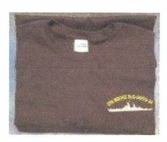
Embroidered Tee Shirts $15.00 each (2X & 3X add $2.00)